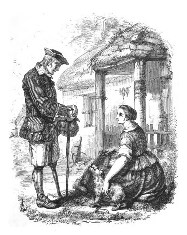
" I'm Peggie '" said the young woman, with a blithe, good-humoured smile .- Page 304.